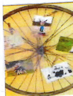
NOTES FROM YOUR CURATOR

This has been an unusual summer at the Museum. After a major rainfall we had a foot of water in the basement. Fortunately for us we lost very few artifacts. The museum was closed for approximately 6 to 8 weeks in order to dry out the basement and fix electrical fixtures and make sure there was no mold downstairs. We have been organizing and getting ready for Lollipop Lane making adjustments to the ornaments we bought. We increased the amount we ordered to accommodate members needs. We will be hosting the Not So Spooky Halloween Party on October 28 th , Sunday from 1 to 2:30 PM. Please come and enjoy the fun. Come in costume if you would like. Tell your neighbors and friends to come and join us. We would love a big turnout.